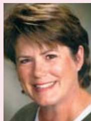
Designed by GERRI ROBINSON