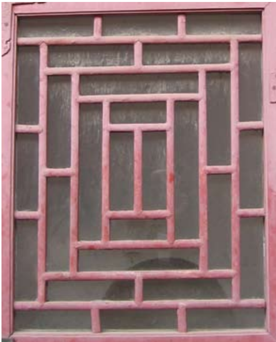
Inspiration for McCall's Doorway to China Quilt Block.

Assorted lights \frac{5}{8} - \frac{7}{8} yard total Assorted darks \frac{1}{2} - \frac{3}{4} yard total