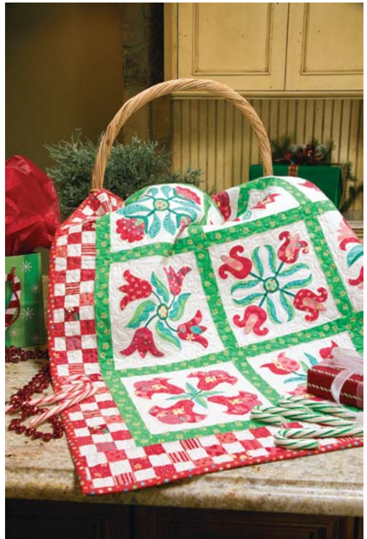
Wall hanging (34 1/2" x 43 1/2") version patterned in McCall's Quick Quilts , December/January 2009