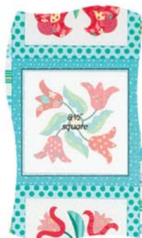
Block Cutting Diagram